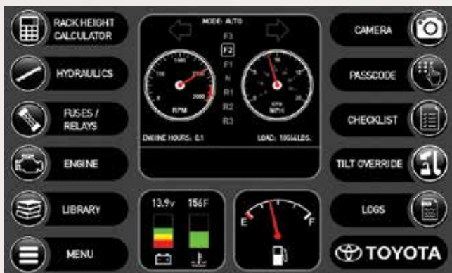
MD4 Display - High-Capacity Marina Forklift